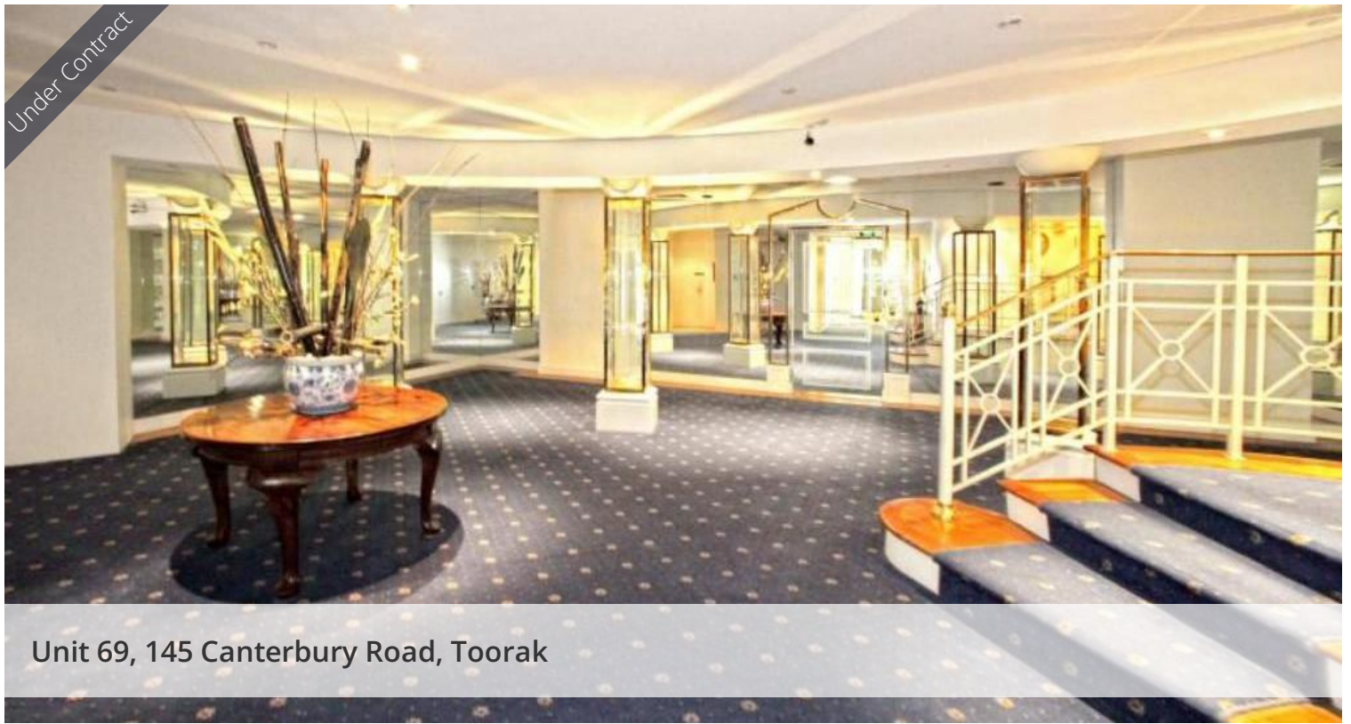
Unit 69, 145 Canterbury Road, Toorak