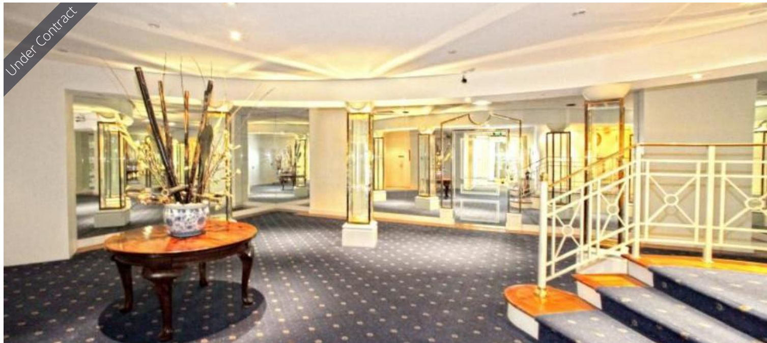
Unit 69, 145 Canterbury Road, Toorak